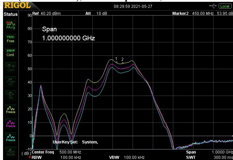
S21, Gain sweep frequency response to 1GHz. 10dB/div & 100MHz/div. Yellow = HIGH power, Magenta = MED, Cyan = LOW Markers are 70cm band edges